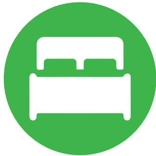
Single / Double bed Sharing rooms