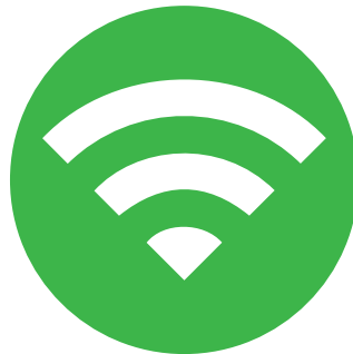
WIFI - Upon Request