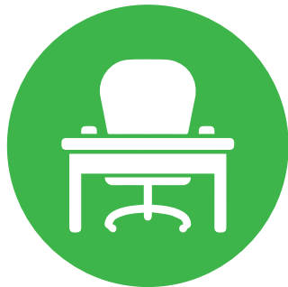
Work Table and Chair